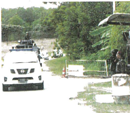
Pasukan Gerakan Am (PGA) negara diarah meningkatkan kawalan di semua 151 pos keselamatan di sempadan Malaysia-Thailand bagi mengekang penularan Mpox. - Gambar hiasan

berkata, penyebaran ajaran sesat Millah Abraham dalam negara ketika ini dilihat terkawal, namun polis bersama dengan